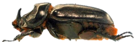
Figure 2: Female coconut rhinoceros beetle.