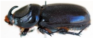
Figure 1: Male coconut rhinoceros beetle.